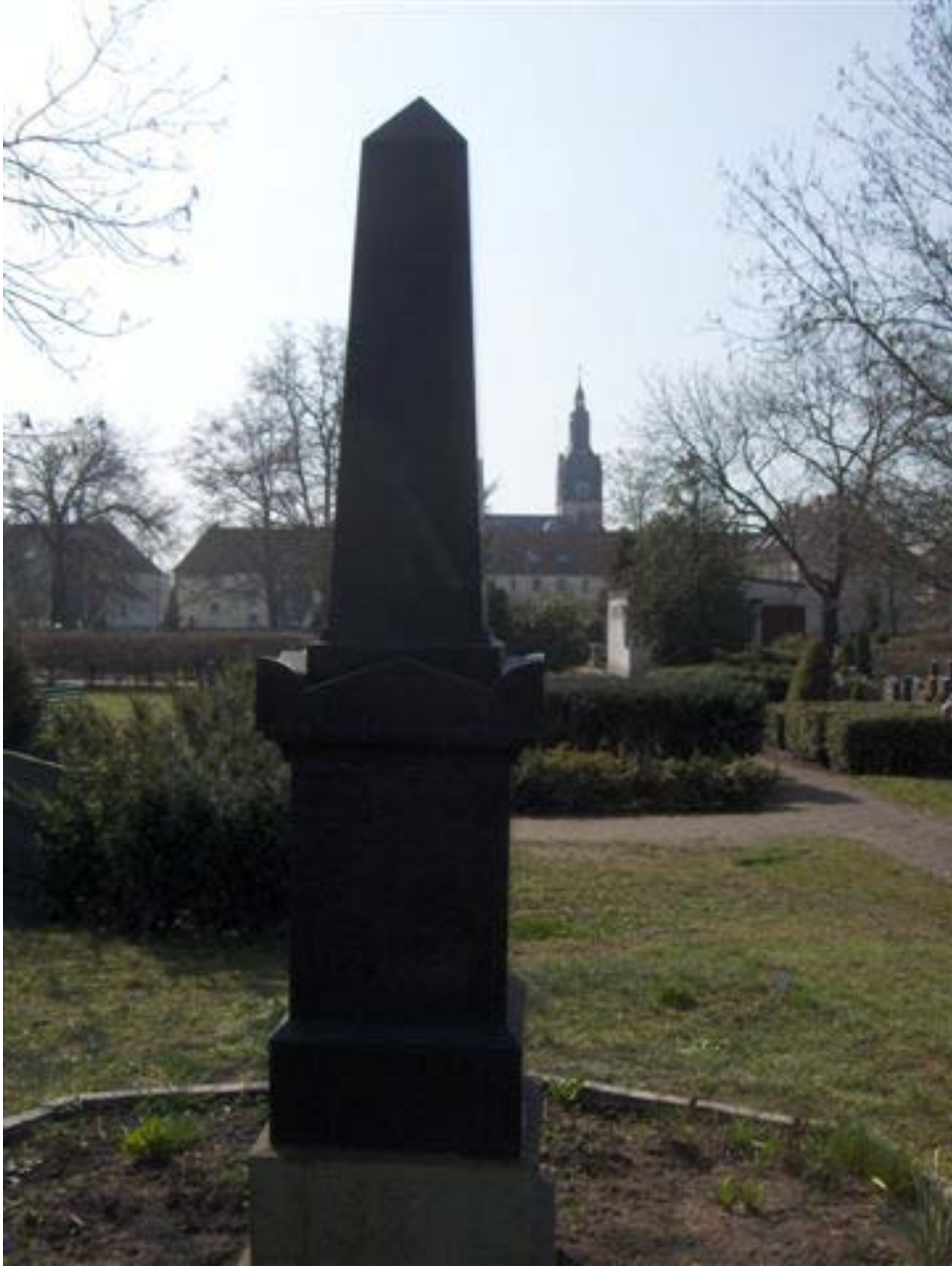
This image shows the church in the background.